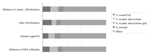
Fig. 2. Breakdown of execution per function in a WRF simulation, using different systems.

Several instrumented executions of WRF were run to determine what module to port/optimize. Table 1 shows the computing systems that were utilized for the profiled executions. Table 2 describes temporal and geographical properties of the WRF input domains used, and Fig. 2 shows the percentage of execution time used by the most time-consuming functions, the one presumably benefit most from the added power of GPUs are the cloud microphysics ( wsm52d ) and scalar advections, corresponding to over 25% of the total execution time.