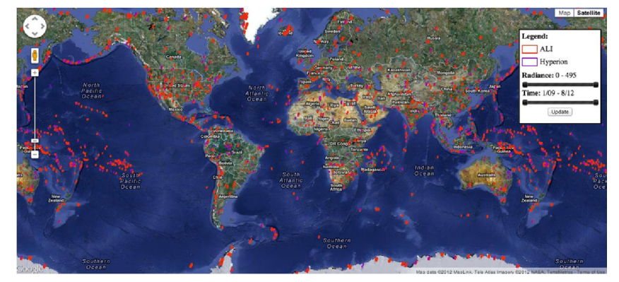
Figure 1 . A visual representation of all of the available Matsu images can be found at matsu.opensciencedatacloud.org.